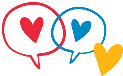
Monitorings that have been completed